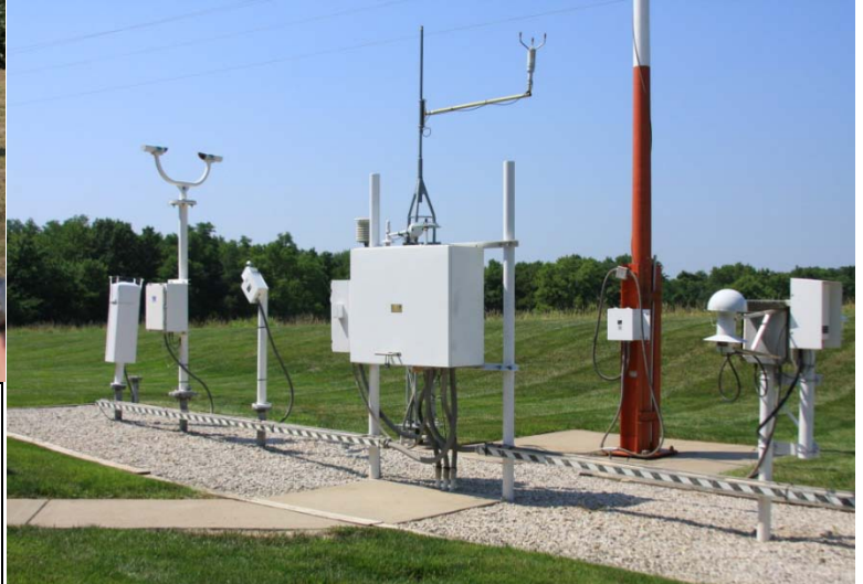
Above – launching a weather balloon at Topeka Above right – underground at Subtropolis Business Park Bottom right – Weather monitoring equipment at the NWSTC site

In between these activities, we worked through different modules that have been developed by the AMS. Some of my favourite topics included El Nino / La Nina, Solar Radiation, air pressure and jet streams, tornados conditions for ice storms, and of course – understanding the mechanics of snow storms. These are modules that can be shared with other teachers and used directly in the classroom with students.